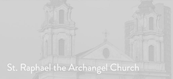
St. Raphael the Archangel Church