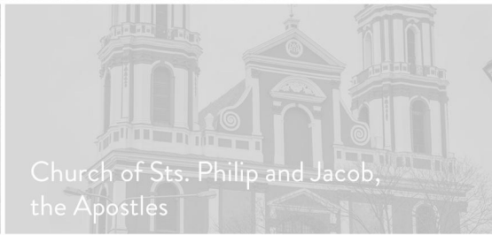
Church of Sts. Philip and Jacob, the Apostles