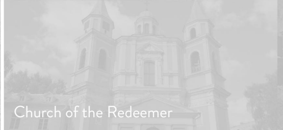
Church of the Redeemer