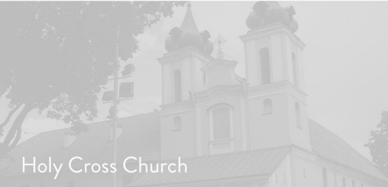
Holy Cross Church