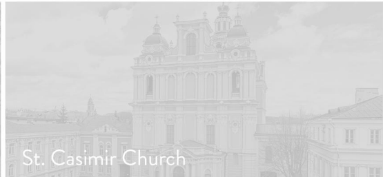
St. Casimir Church