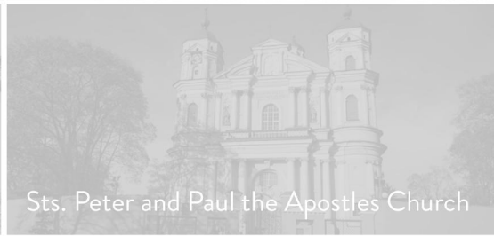
Sts. Peter and Paul the Apostles Church