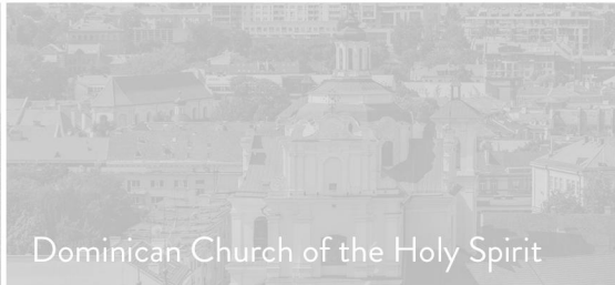
Dominican Church of the Holy Spirit