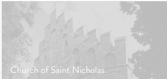
Church of Saint Nicholas