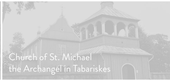
Church of St. Michael the Archangel in Tabariskes