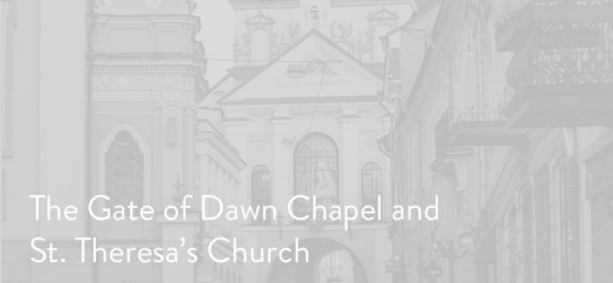
The Gate of Dawn Chapel and St. Theresa's Church