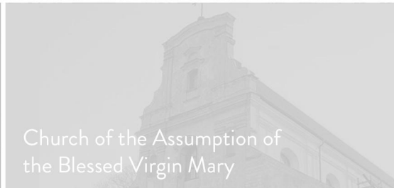
Church of the Assumption of the Blessed Virgin Mary