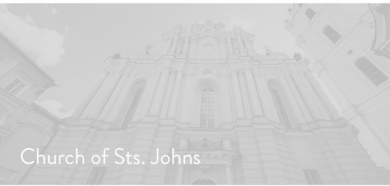
Church of Sts. Johns