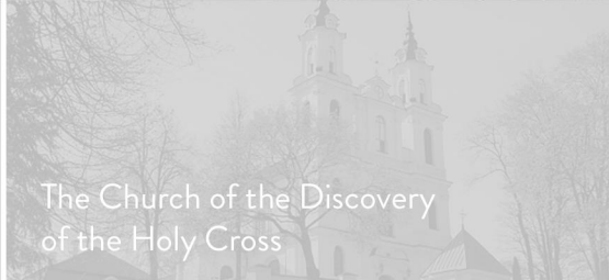
The Church of the Discovery of the Holy Cross