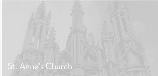
St. Anne's Church