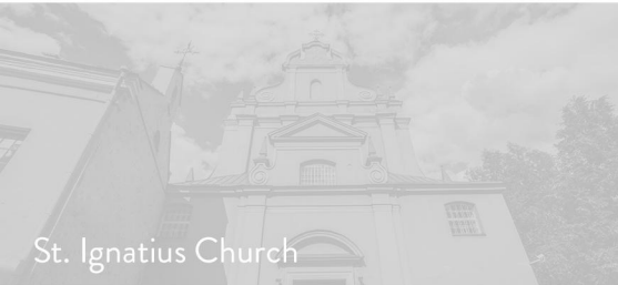
St. Ignatius Church