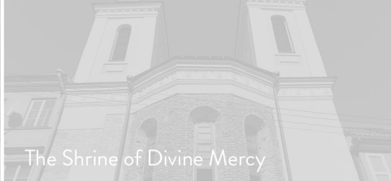
The Shrine of Divine Mercy