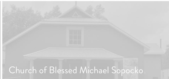
Church of Blessed Michael Sopocko