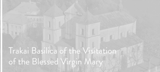
Trakai Basilica of the Visitation of the Blessed Virgin Mary